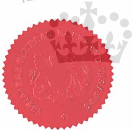
Registrar of Companies