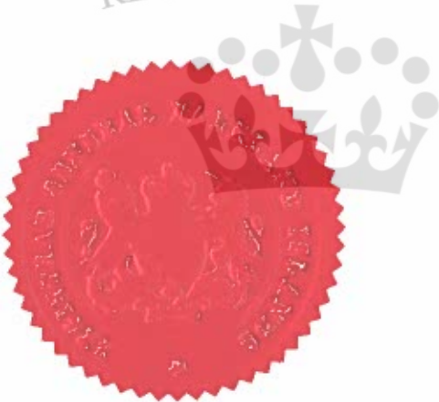
Registrar of Companies