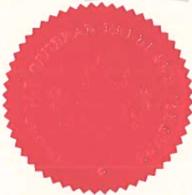
Registrar of Companies