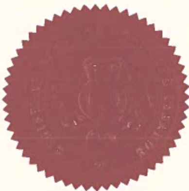
Ag. Registrar of Companies