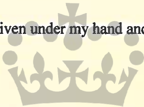
Registrar of Companies

Given under my hand and seal this 3rd day of December 2003