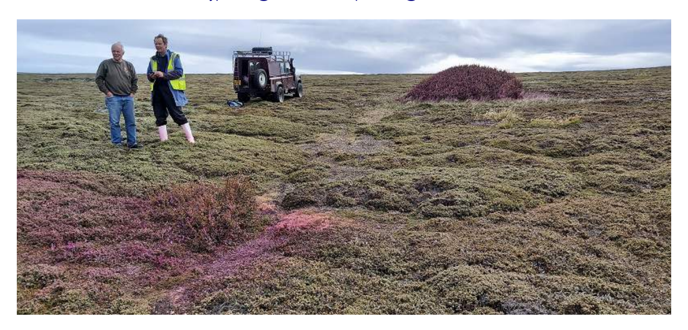
Weddell Island, 31 December 2020: main calafate bush at right; outlier in foreground.