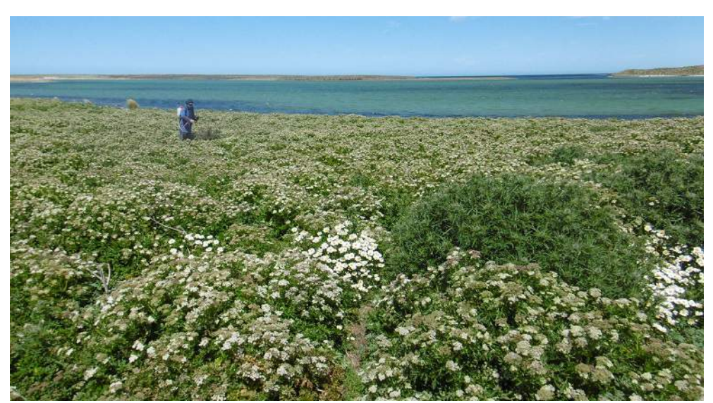
Spear thistles amid bluegrass, wild celery and oxeye daisies, North East Island (north), 8 January 2021