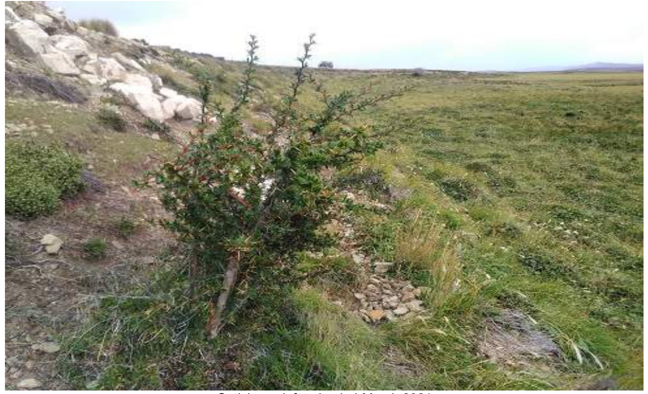
Outlying calafate bush 4 March 2021