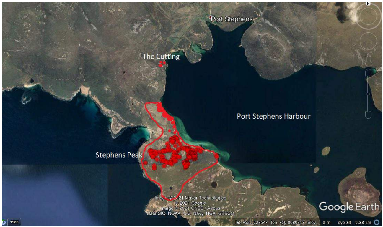
The Stephens Peak area that was searched for mouse-eared hawkweed (red line); red circles show infested areas sprayed.