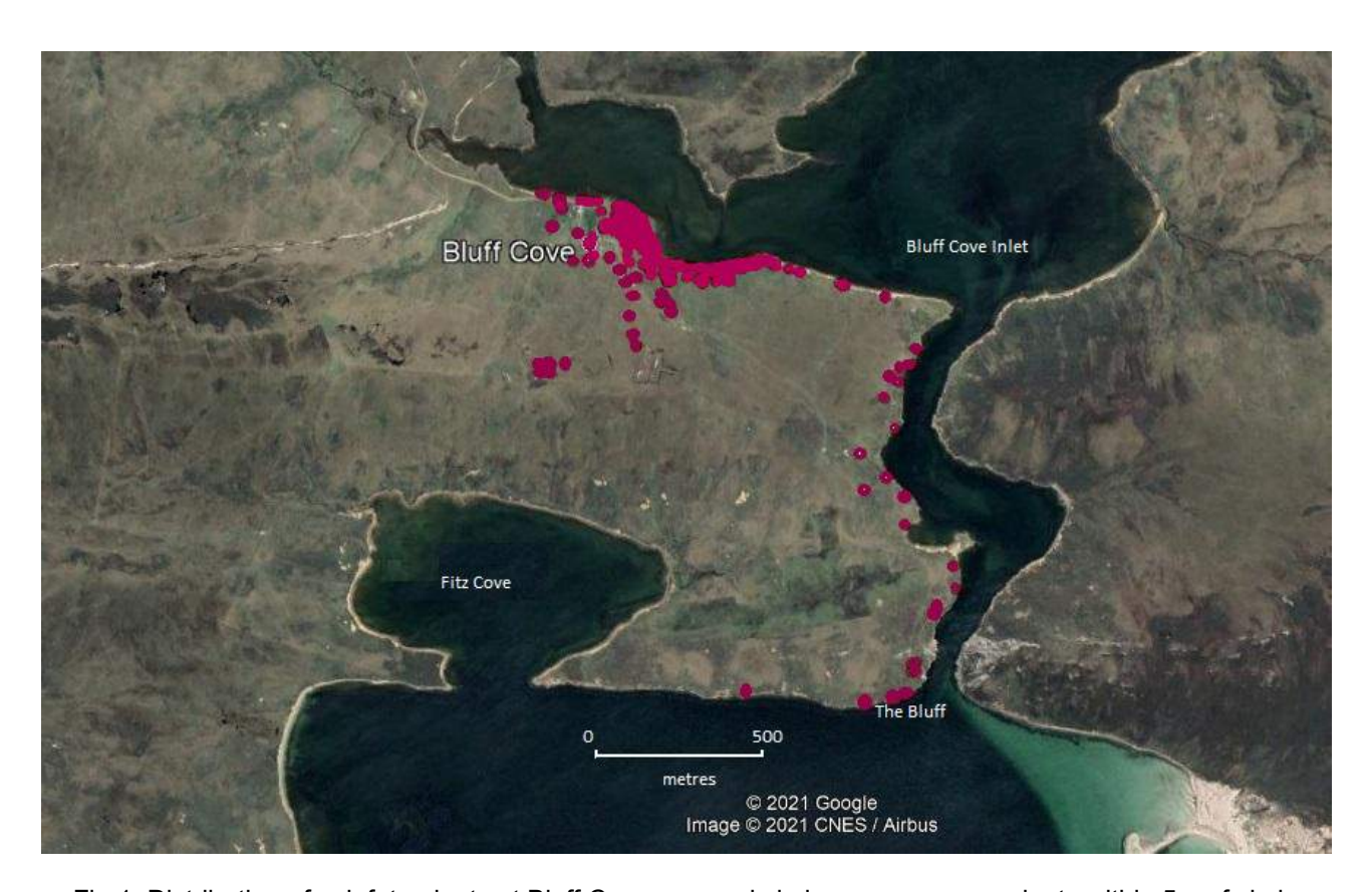
Fig 1. Distribution of calafate plants at Bluff Cove: one red circle = one or more plants within 5m of circle