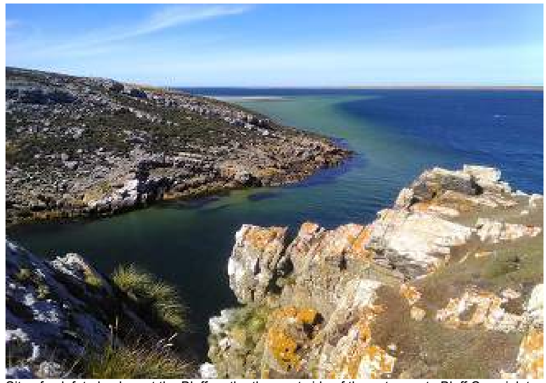
Site of calafate bushes at the Bluff on the the west side of the entrance to Bluff Cove inlet.