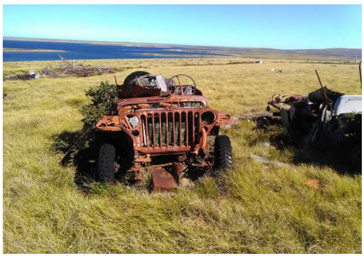
Calafate amongst old vehicles at Bluff Cove, February 2021