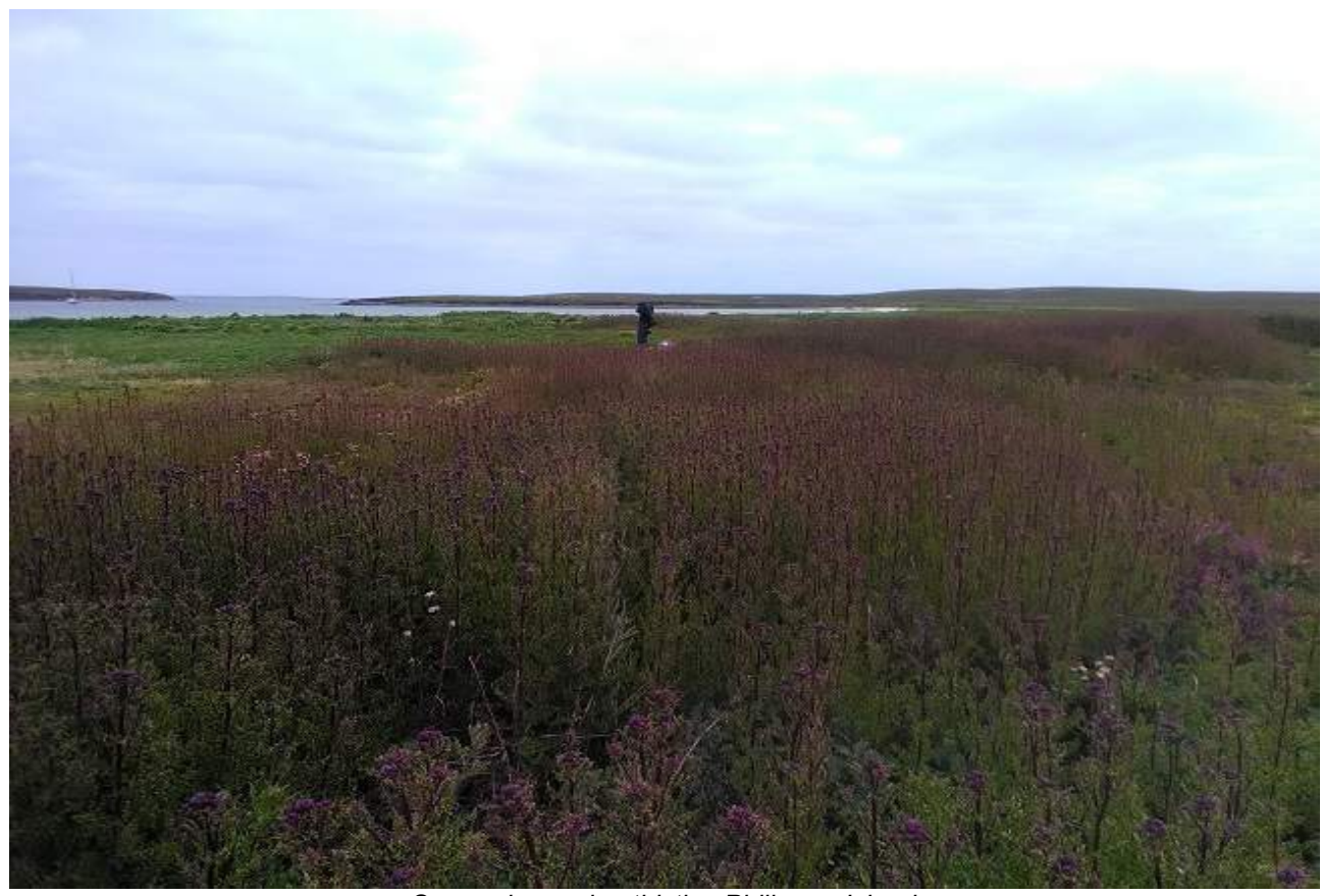
Sprayed creeping thistles Philimore Island