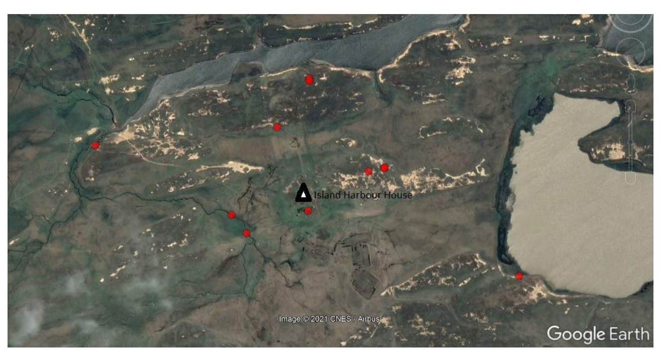
Fig 1. Calafate plants sprayed at Island Harbour in 2021. Red circle = location of one or more bushes