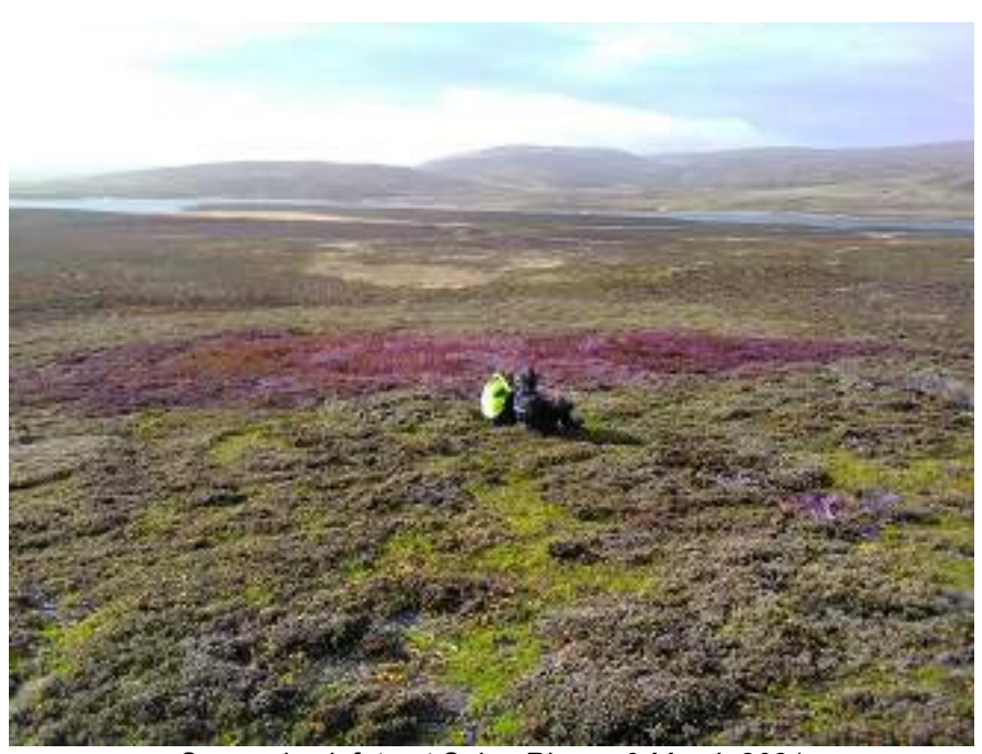
Sprayed calafate at Snipe Rincon 9 March 2021