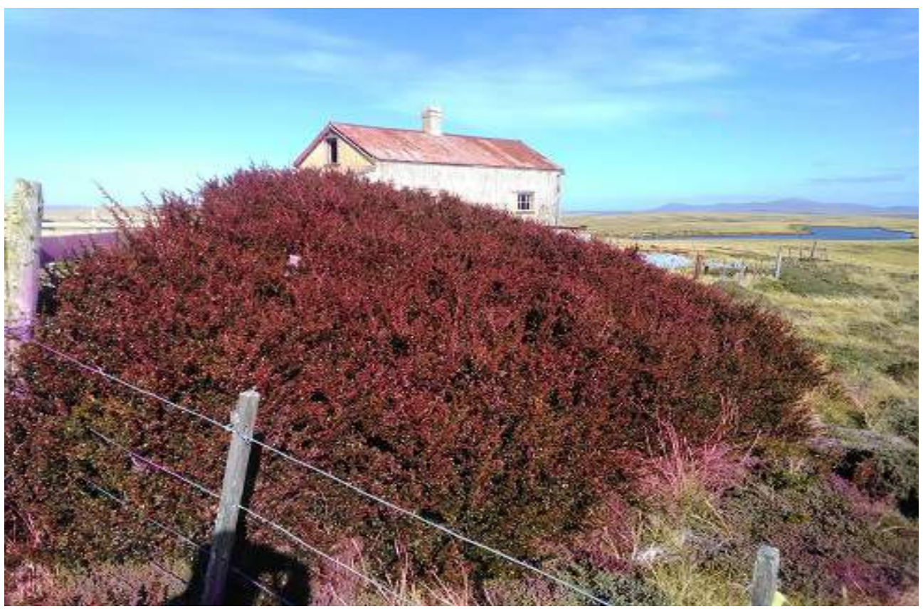
Sprayed calafate bush near sheep pens 1 April 2021