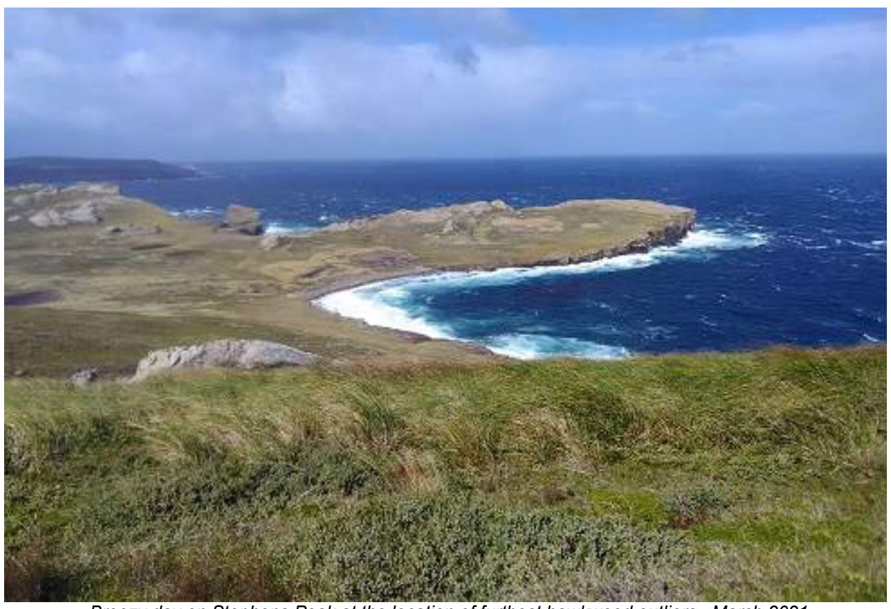
Breezy day on Stephens Peak at the location of furthest hawkweed outliers. March 2021