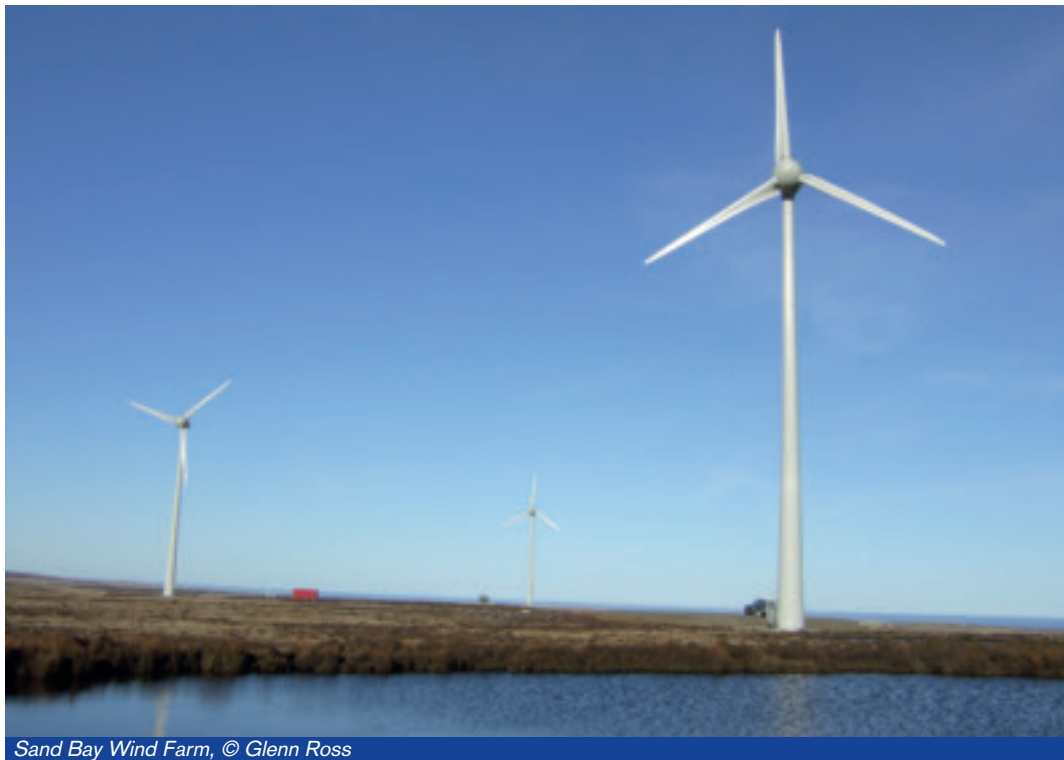
Sand Bay Wind Farm

Three new wind turbines, which went online in February, will generate up to 40% of the total electricity consumed in Stanley. The first three turbines were installed in 2007 and resulted in the displacement of 26% of annual fuel consumption.