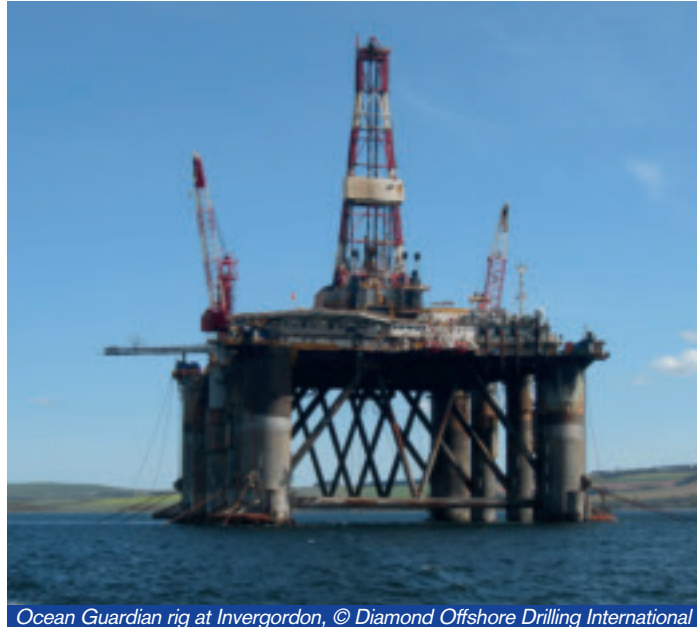
Ocean Guardian rig at Invergordon, © Diamond Offshore Drilling International