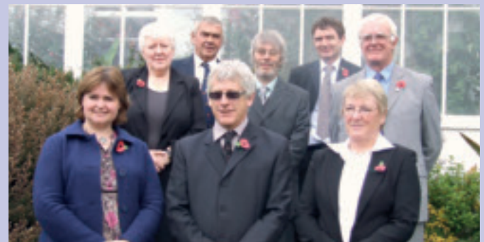
Members of the Legislative Assembly