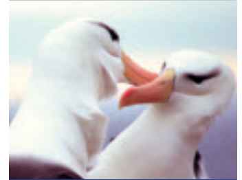
Black-browed albatross

The Falkland Islands have recently adopted their second Plan of Action to reduce seabird mortality due to trawling activity. The first Plan was approved in 2004, following the work of the Seabird at Sea Team, involving collaboration between Falklands Conservation, RSPB and FIG. It is hoped that the Plan will build on the success of the long-line Fishery's 2004 plan, when a 90% reduction in seabird deaths was recorded.