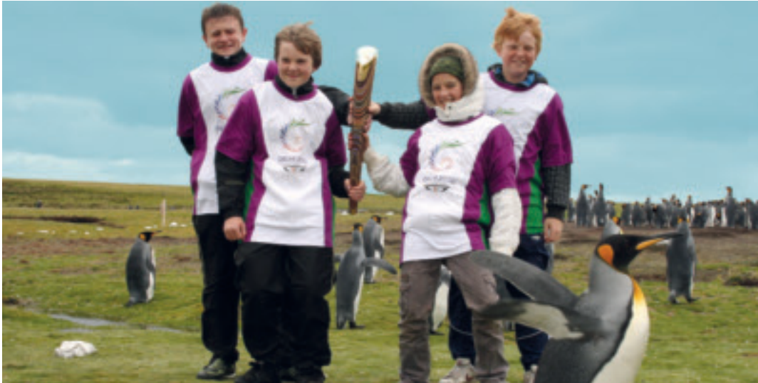
Falklands children (and penguins) posing proudly with the baton

The Falkland Islands were the southern-most stop for the 2010 Commonwealth Games Queen's Baton Relay team when it visited the Islands in February. The Baton will have been 'passed' to 71 Commonwealth countries during its pre-Games journey. The Relay Team was met by the Governor, Assembly Members and representatives from the Mount Pleasant military base before embarking on a busy schedule around the Islands, including the highest point, Mount Usborne.