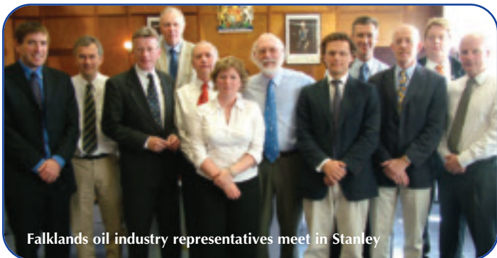
Falklands oil industry representatives meet in Stanley