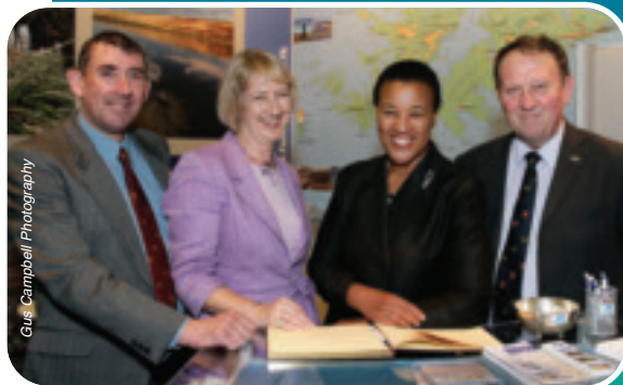
Labour Party Conference