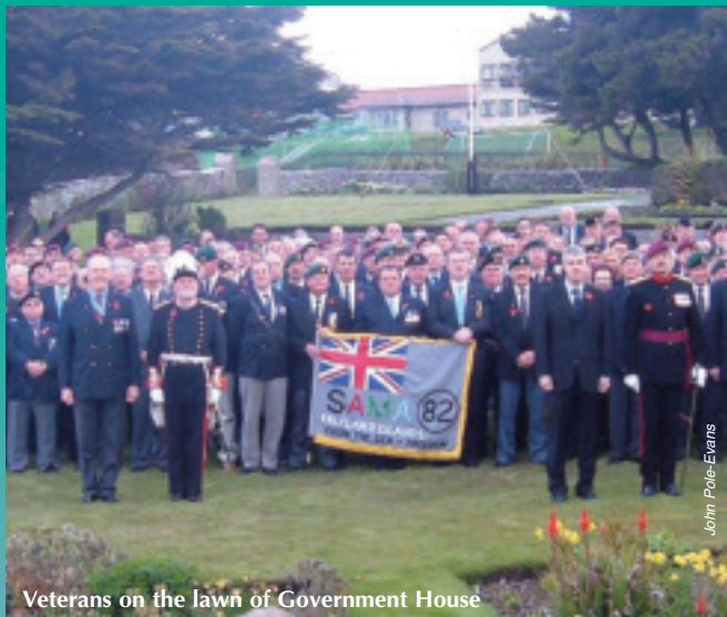
Veterans on the lawn of Government House

Islanders welcomed 250 Falklands War veterans and next of kin who took part in a Pilgrimage to the Falklands from 6 to 13 November for a week of reflection and to explore the modern Falkland Islands. The veterans were hosted in the homes of local families, who expressed their gratitude for the sacrifices made for their freedom. Commemorations included a service of remembrance held at the Blue Beach Cemetery at San Carlos and veterans made more personal visits to places of importance to them. UK Veterans Minister, Derek Twigg MP, was also in the Islands to coincide with the Pilgrimage.