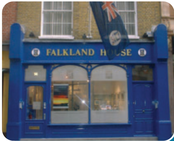
Falkland Islands Government Office