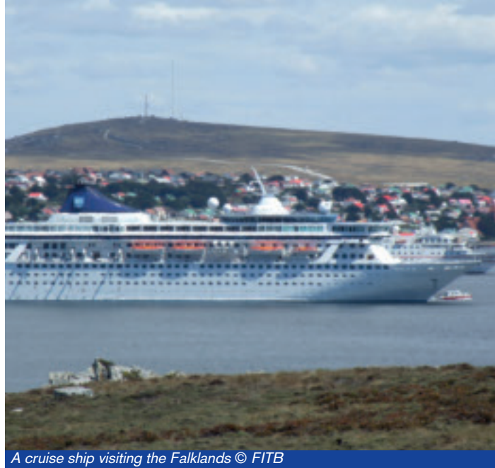
A cruise ship visiting the Falklands

The Falkland Islands are riding on the crest of a wave following a record-breaking visitor season with increased visitor numbers, new tourist facilities available, and confidence in further growth. The recent season (October 2008 – April 2009), which saw 62,600 passengers arriving on 105 ships, compared to 62,200 in 2007-2008, has topped off a decade of visitor number increases resulting in impressive growth of 218% over the past 10 years. On 6 February a new record was set when 4,053 visitors arrived on board cruise ships in one day. Cruise tourism brought almost £4.2 million revenue into the Falklands in the 2008-9 season, while land-based tourists spent an estimated £3.2 million.