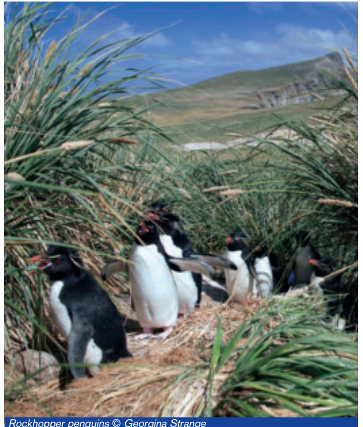
Rockhopper penguins

www.epd.gov.fk/wp-content/uploads/BiodiversityStrategy09.pdf